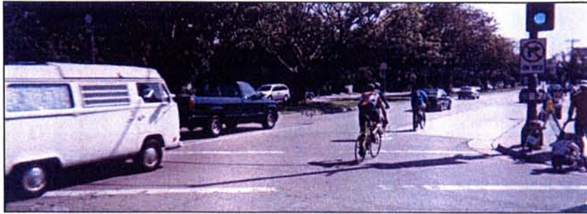
Scene Photo 1